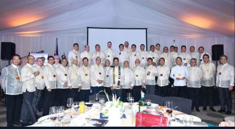
55th Induction & Handover Ceremony Click to explore >

We've got them in archives you can access in just a few clicks.