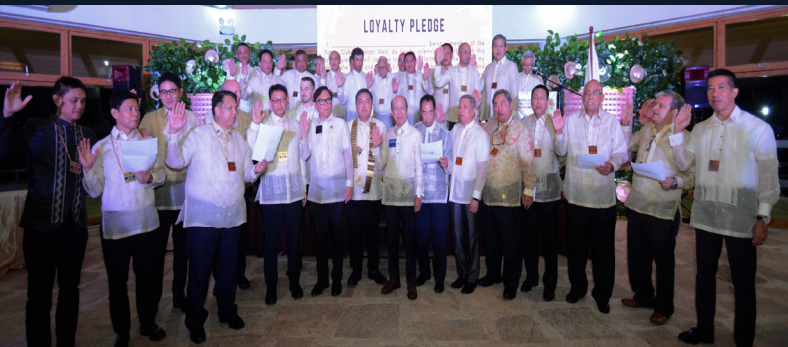
54th Induction & Handover Ceremony

Missed out on past events? We've got them in archives you can access in just a few clicks.