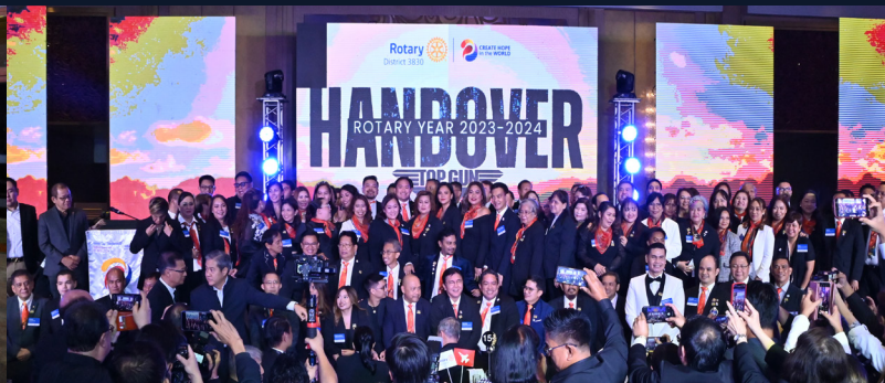
District 3830 Handover Ceremony