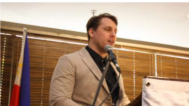
Mr. Roy Moore in his speech