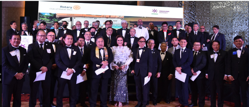
53rd INDUCTION & HANDOVER