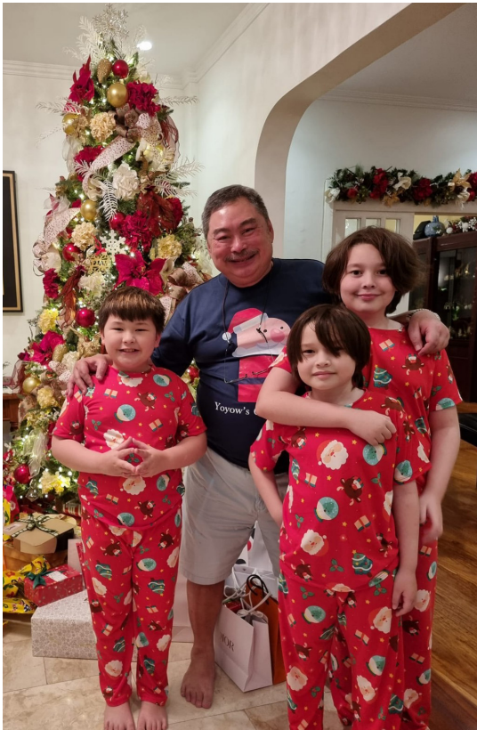
Spending Christmas with my apos.

hope that the challenges facing the world and the nation will be solved, such as high inflation, the continued threat of COVID-19, and a looming global recession.