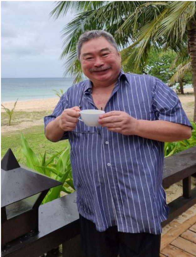
Five days at Balesin was all I needed to recharge for a busy 2023 ahead.

about prospects in the business world especially in the banking industry, as well as the forecasted global recession.