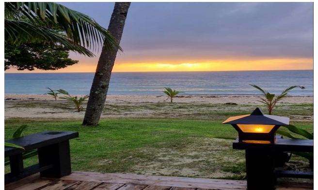
Relishing the last sunset of 2022.

Feel free as well to contribute stories and personal milestones to our weekly newsletter. We will be glad to share your pride and fill up the "Member's Spotlight" section of our West Side Story with good news from you.