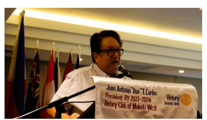
PP/DS Mon Guerrero Introduces the Guest of Honor