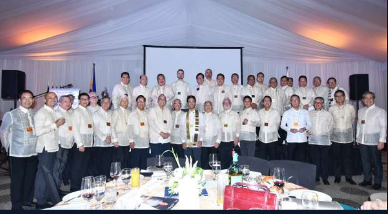
55th Induction & Handover Ceremony Click to explore >

We've got them in archives you can access in just a few clicks.