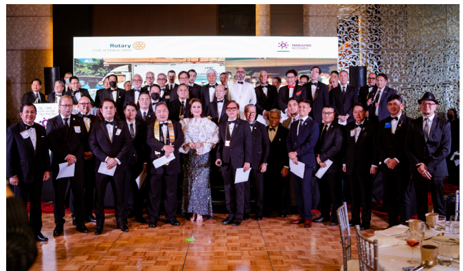
RCMW Members Singing the Makati West Hymn