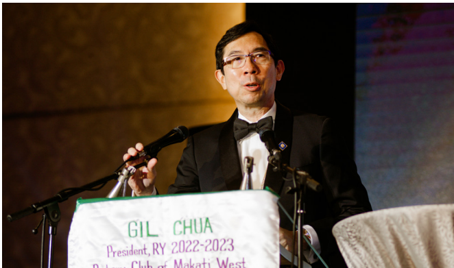
PP TG Limcaoco Introduces the Guest of Honor