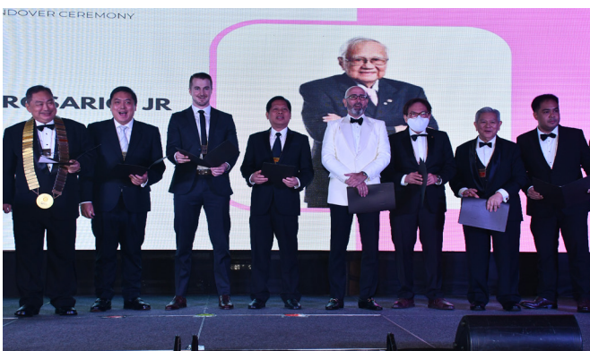
Presentation of Officers, BOD & Club Advisers