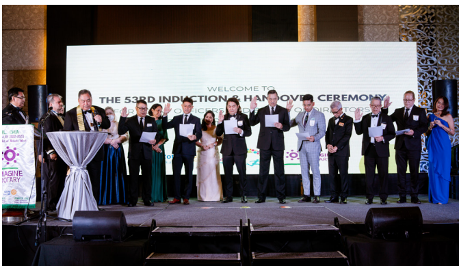
Charging & Induction of New Members & Satellite Members