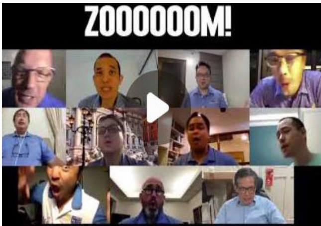
RC Makati West Board of Directors Induction Performance - ZOOM!

https://drive.google.com/file/d/1ygTBmuacsNdATQqsgSC0NHrED6ZE2eCC/view?usp=sharing