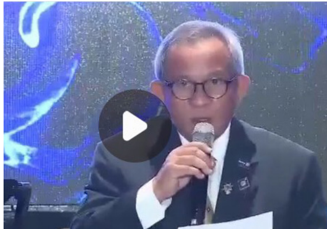
Full Induction Video

https://drive.google.com/file/d/11cZv4VvchcqRUe0PQabLebNKYf11bG_5/view?usp=sharing