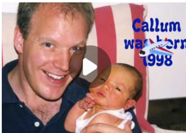
You can call me Pres. Al