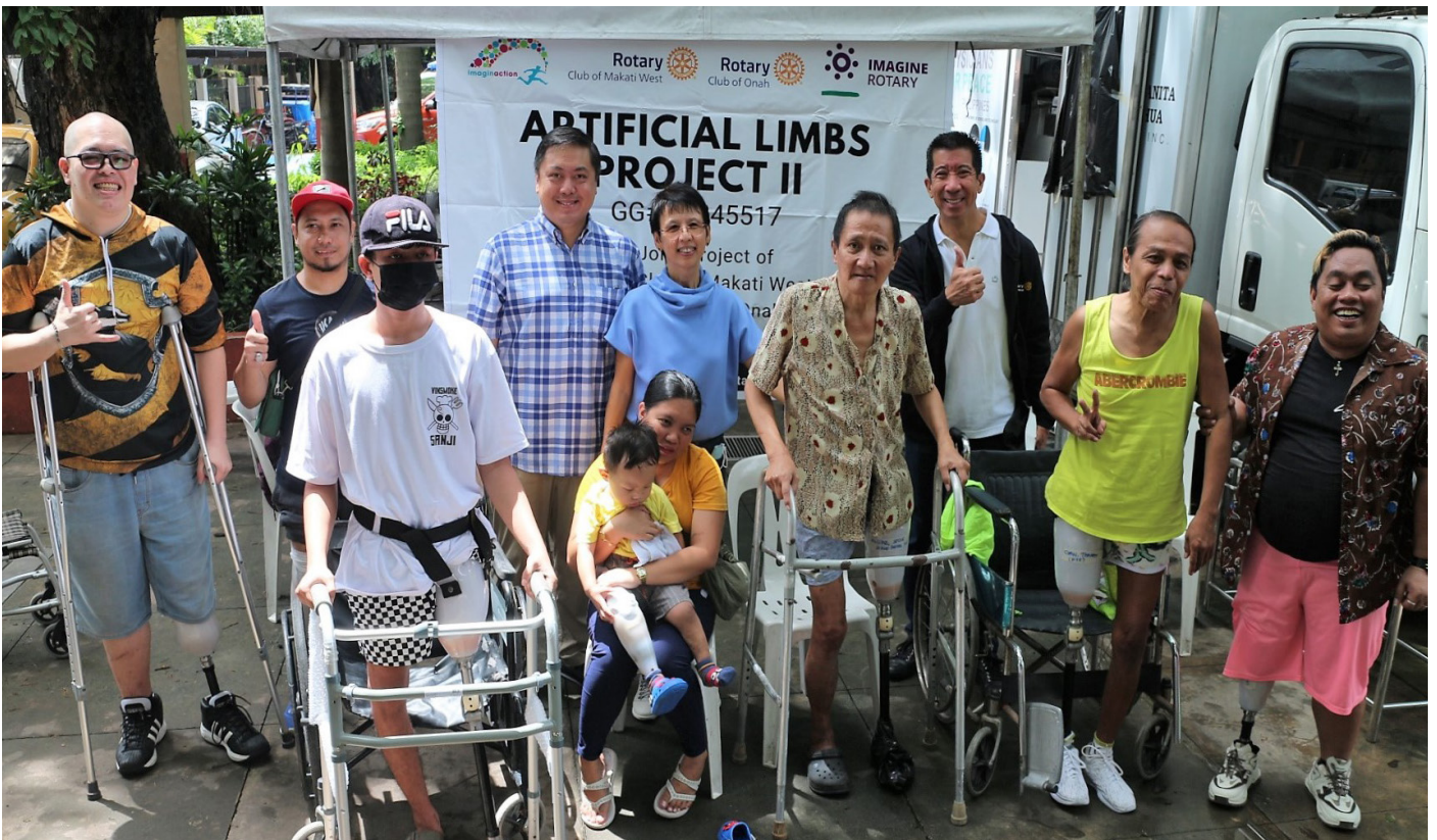
Witnessing the turnover of prostheses for Artificial Limbs Project

Turnover of Artificial Limbs to Amputee Patients (GG# 22345517 with Rotary Club of Onah) July 17, 2023 at SPED Center, Pasig City