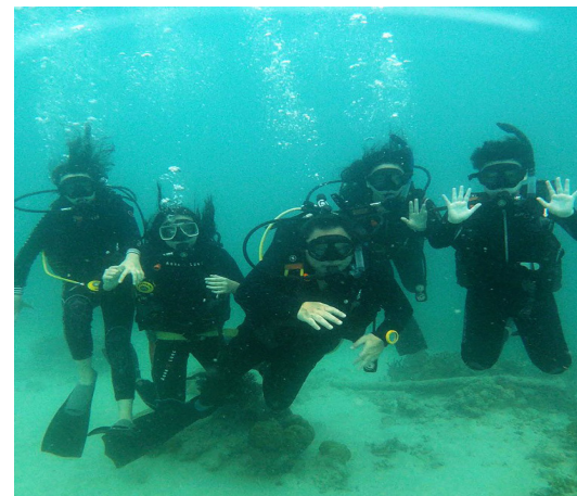
Scuba diving in beautiful Coron with my apos (grandkids)

I was not in our meeting last Thursday because I spent vacation time with my grandchildren in Coron, Palawan. So I was able to check an item off my bucket list - that is, to dive with my grandkids! It's such an awesome experience.