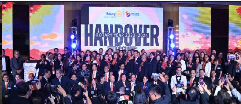
District 3830 Handover Ceremony