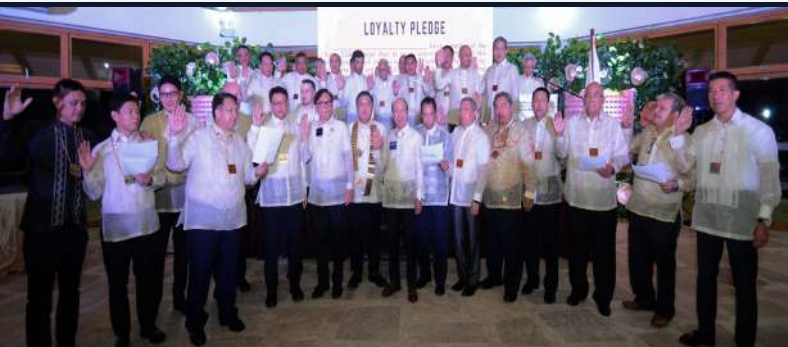
54th Induction & Handover Ceremony

We've got them in archives you can access in just a few clicks.