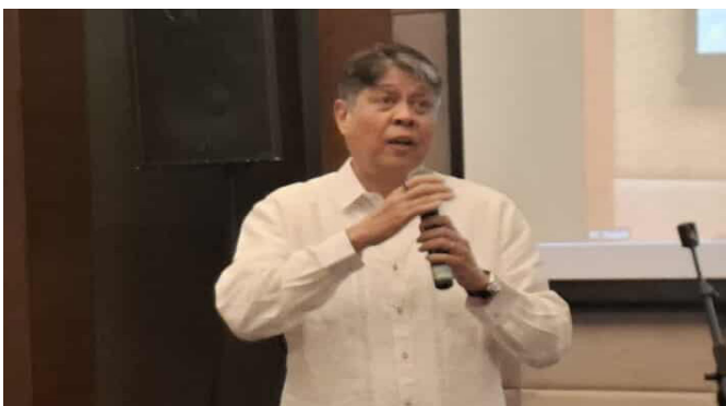
Sen. Francis "Kiko" Pangilinan in his speech