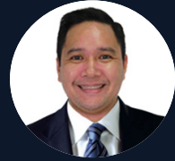
April 28 RTN. BIBIT FACTORAN Birthday