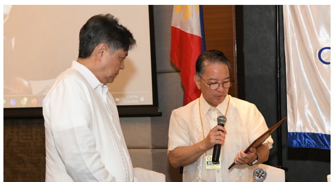
Sen. Francis "Kiko" Pangilinan received from the Club the Gift of Life Certificate