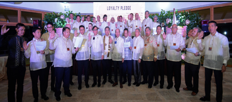
54th Induction & Handover Ceremony

We've got them in archives you can access in just a few clicks.