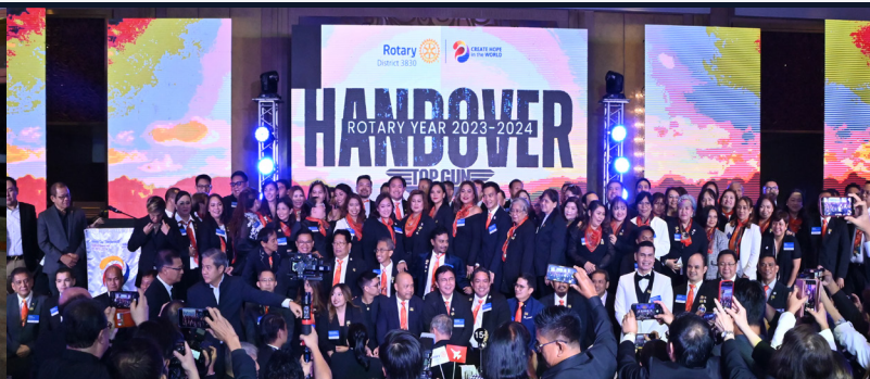
District 3830 Handover Ceremony