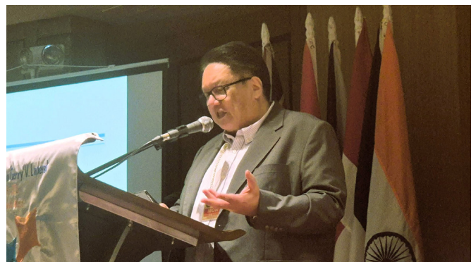
PP Mon Guerrero introduces the guest of honor