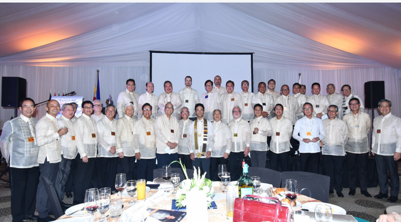
55th Induction & Handover Ceremony

We've got them in archives you can access in just a few clicks.