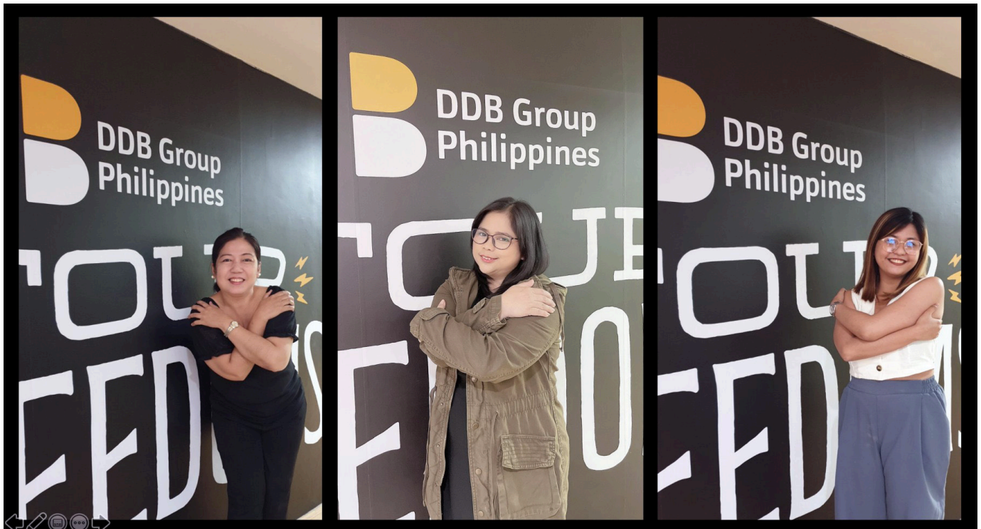
DDB employees doing the #IWD2023 #EmbraceEquity pose

The goal of this year's observance of Women's Month is to emphasize the difference between two interchangeable terms - Equity and Equality.