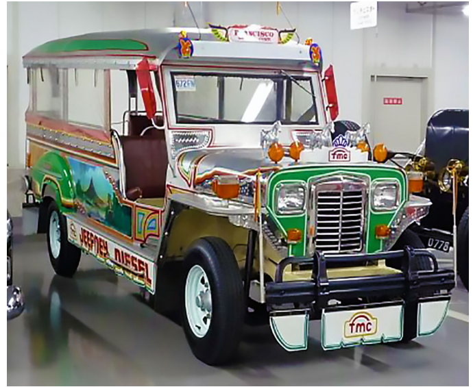
The jeepney, an iconic public utility vehicle of Pinoys.

This is also top of mind for me because it's all over the news. And I heard that school kids suddenly don't have classes because of this. The nationwide transport strike has pushed through from March 6 to 12 despite the extension of the LTRFB's move to extend the franchise consolidation of public utility vehicles (PUVs) until the end of the year.