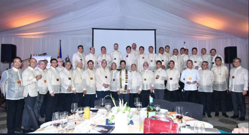
55th Induction & Handover Ceremony Click to explore >

We've got them in archives you can access in just a few clicks.