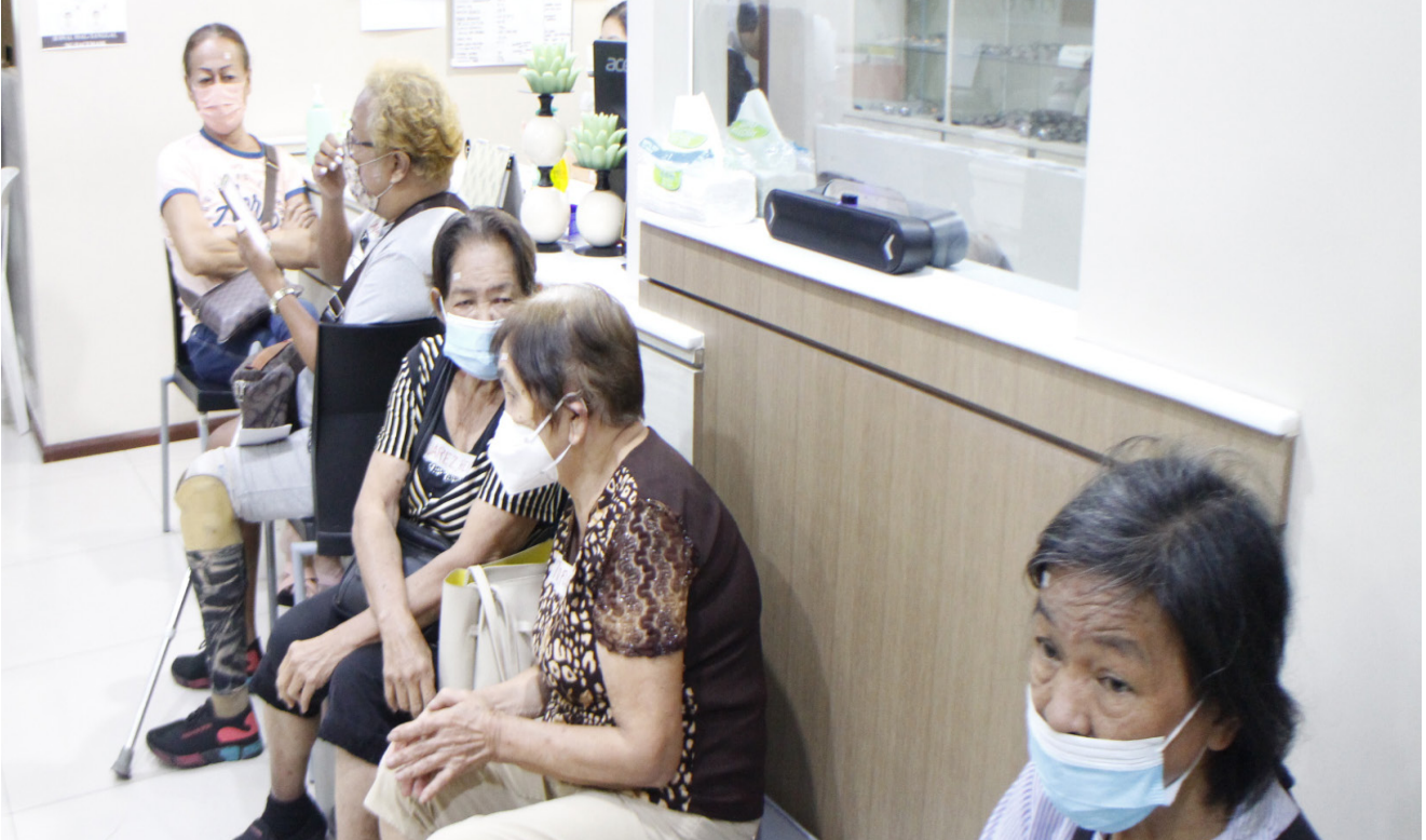
Cataract surgery patients at the lobby waiting for their turn.