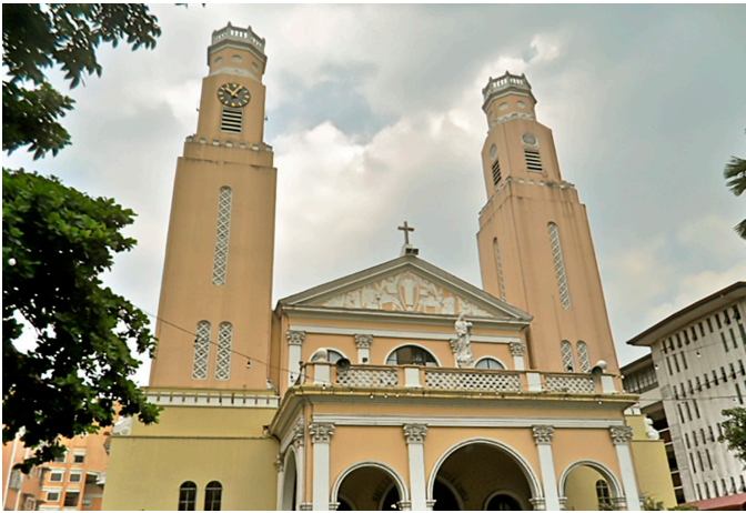
Paco Church, the venue of our club's April 29 Mass Wedding service project.

For our Mass Wedding project, as mentioned last week, 26 couples will join our club sponsored church wedding on April 29 at the Paco Church. Feel free also to drop by to support this project. We provided participants with their wedding attire and accessories, a wedding reception and coordinated the entire event with the parish from start to finish.