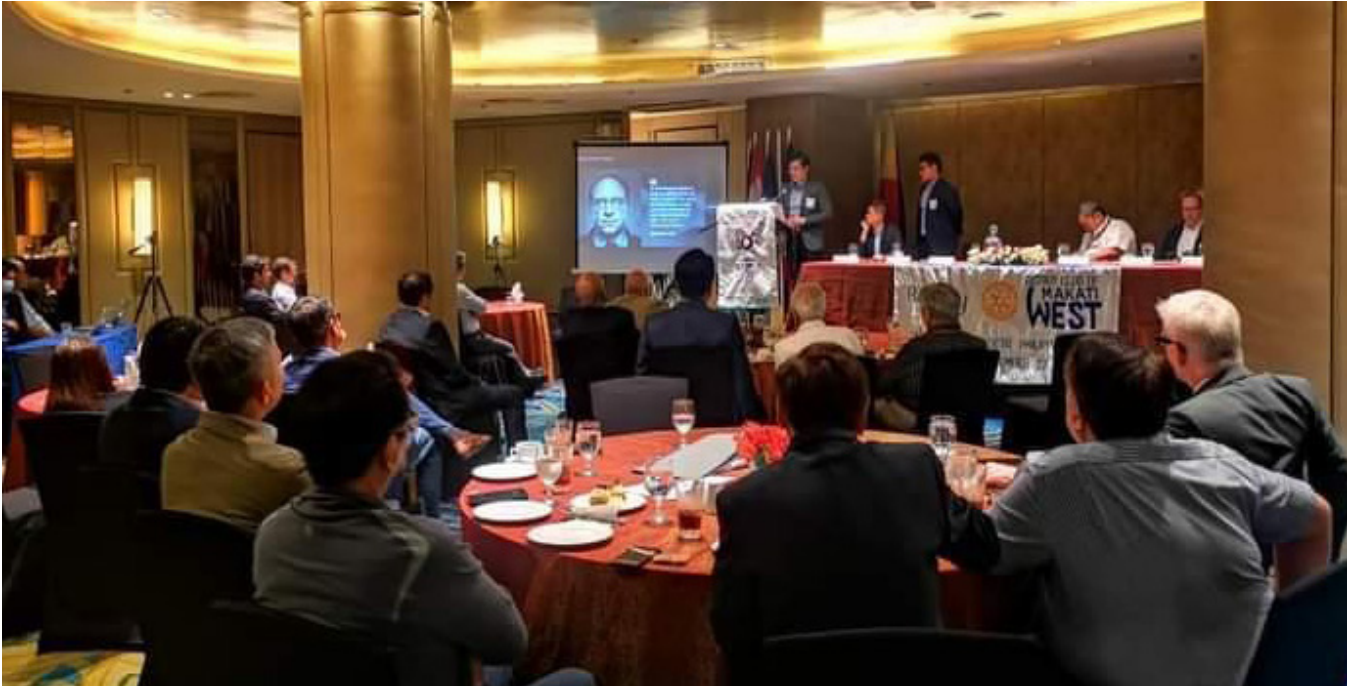
Members eagerly ask the speakers about Artificial Intelligence during the Q&A portion.