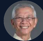
August 10 PP ED BALOIS Birthday