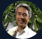
August 5 RTN. TOPE NARCSIO Birthday