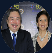
June 21 PP GIL & SPS. GIGI Wedding Anniversary