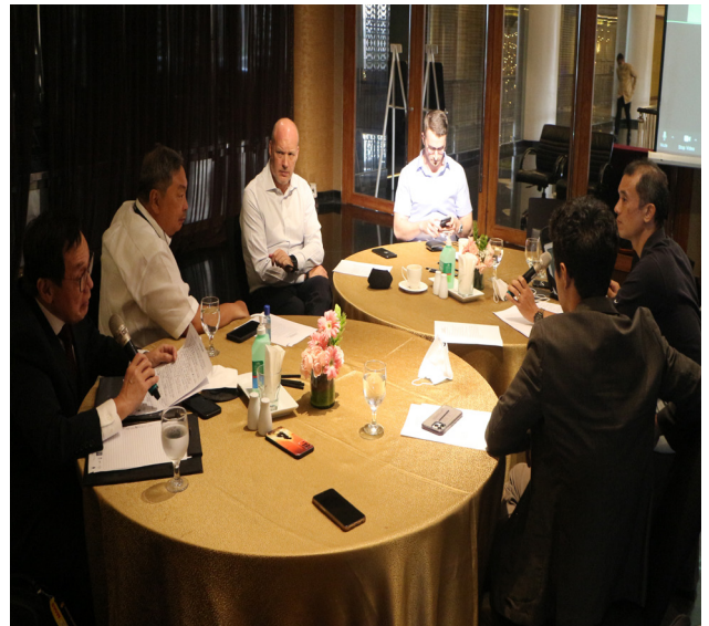
April 21st Board of Directors Meeting; attended in-person and via zoom