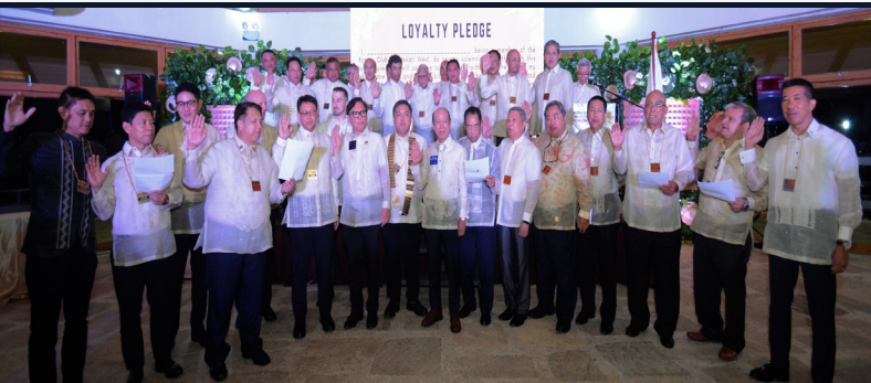
54th Induction & Handover Ceremony

Missed out on past events? We've got them in archives you can access in just a few clicks.