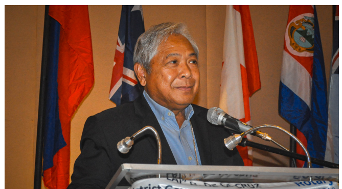
DOTr Sec. Jaime Bautista during his talk