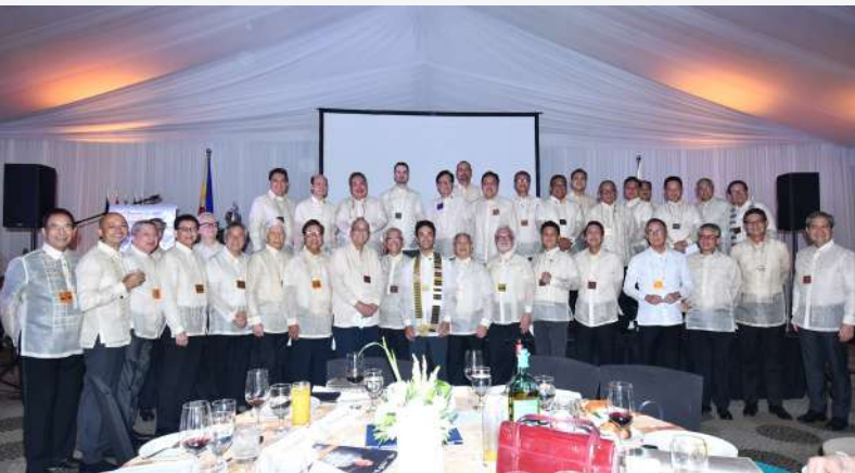
55th Induction & Handover Ceremony

We've got them in archives you can access in just a few clicks.