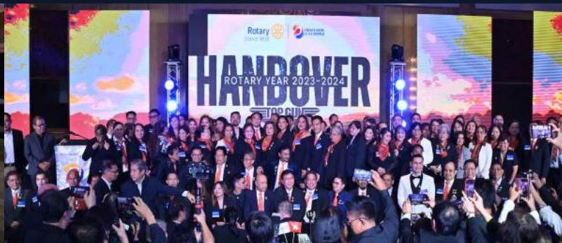
District 3830 Handover Ceremony