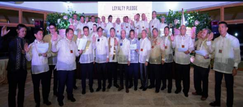
54th Induction & Handover Ceremony

We've got them in archives you can access in just a few clicks.